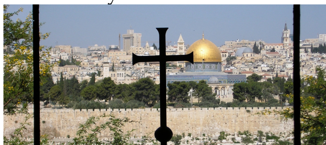
View of Jerusalem from the site where Jesus wept over the Holy City.